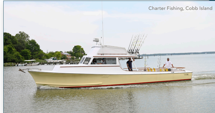
Charter Fishing, Cobb Island