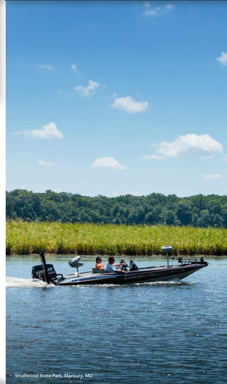
Smallwood State Park, Marbury, MD

301-885-1762, Dickssportinggoods.com/md/waldorf/143