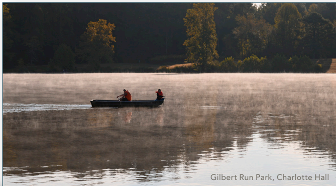
Gilbert Run Park, Charlotte Hall