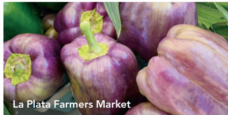
La Plata Farmers Market