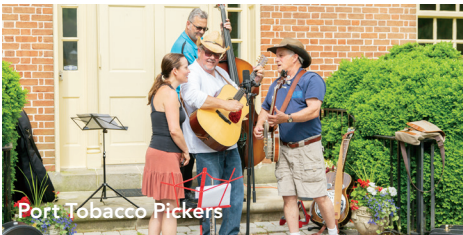
Port Tobacco Pickers

If craft beverages are what you crave, Charles County is becoming known for its local spirits, ales, and coffee. BLUE DYER DISTILLING CO. and PATUXENT BREWING COMPANY are local favorites. WEEBEAN COFFEE ROASTERS serve organic coffee and pastries daily.