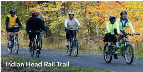
Indian Head Rail Trail