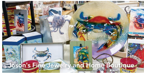
Jason's Fine Jewelry and Home Boutique