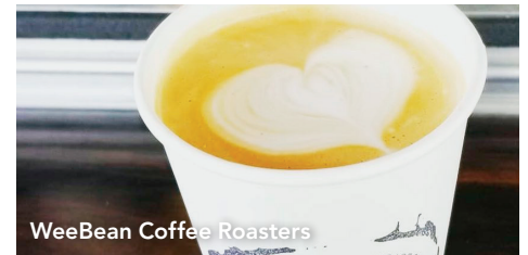
WeeBean Coffee Roasters

Discover the majestic scenic beauty of nature biking on the INDIAN HEAD RAIL TRAIL. Take a hike, go kayaking, or anticipatory anglers can search for largemouth bass at one of our 22 county parks.