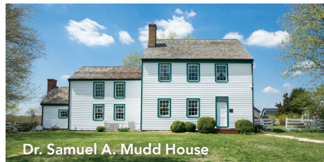
Dr. Samuel A. Mudd House

Journey to Port Tobacco Village, a Maryland port town that was a hotbed of Confederate activity and where residents may have been involved in the conspiracy.