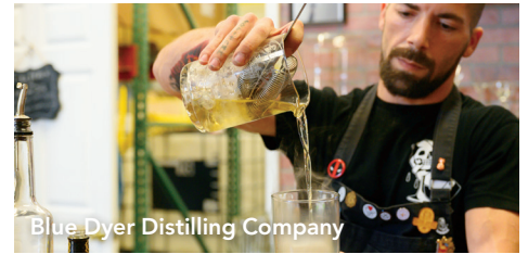
Blue Dyer Distilling Company