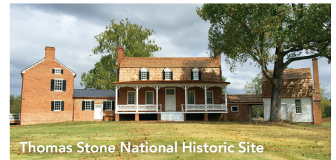
Thomas Stone National Historic Site

Visit the Dr. Samuel A. Mudd House Museum and see where Dr. Mudd fixed the leg of John Wilkes Booth the morning after the assassination of Abraham Lincoln.