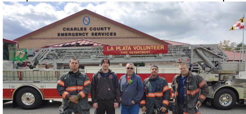
La Plata Volunteer Fire assists DES with bunting