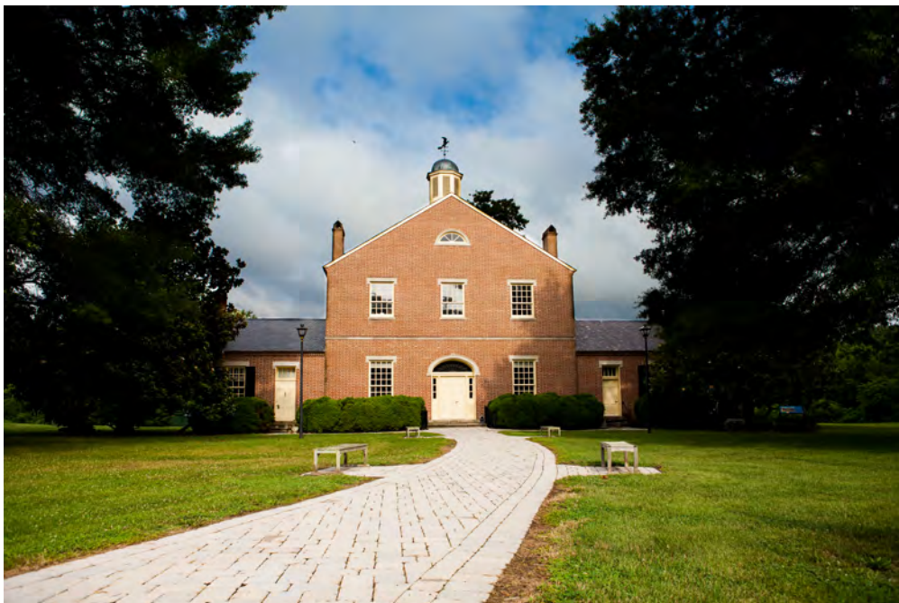
Historic Port Tobacco Courthouse