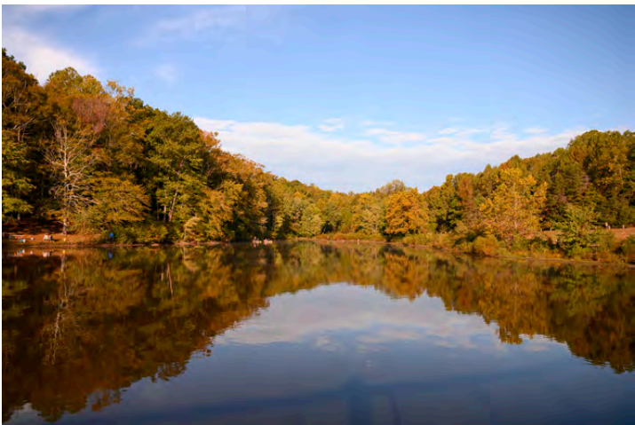
Gilbert Run Park

See Certificate of Insurance under the Library tab on the bswift website.